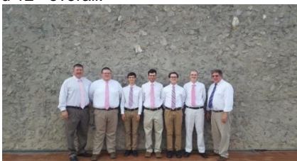
FDHS has placed first overall at the state level in years 2003, 2005, 2006, 2009, 2011, 2012, 2014 and 2016.

Fort Defiance High School once again represented Headwaters SWCD at the State Envirothon competition held at Eastern Mennonite University in Harrisonburg, where they placed 1 st . This team went on to represent the State of Virginia at the international competition held in Ontario, Canada where they placed 12 th overall.